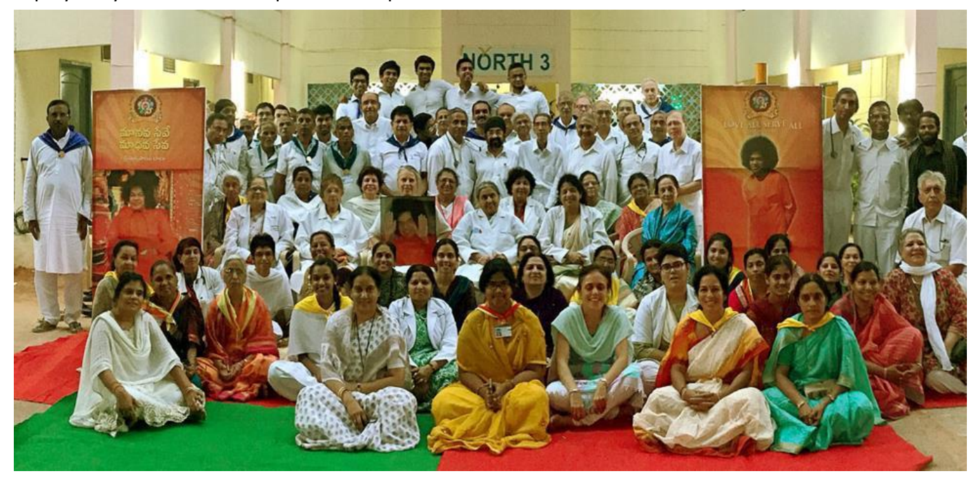
Medical and Non-Medical Volunteers

Volunteers: 46 volunteers assisted the Camp with all non-medical duties such as registration, patient flow, vital signs recording (weight and Blood Pressure), translation from Telugu, Hindi, Spanish into English and vice versa, and pharmacy tasks. In additional, Seva Dals from the Andhra Pradesh state cadre were deployed by their units to help at the camp.